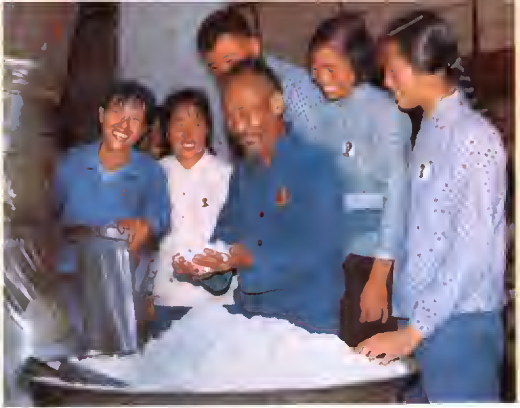
fertilizer plant. ber visiting the izer Plant joy- enous fertilizer. shipment. commune produc-